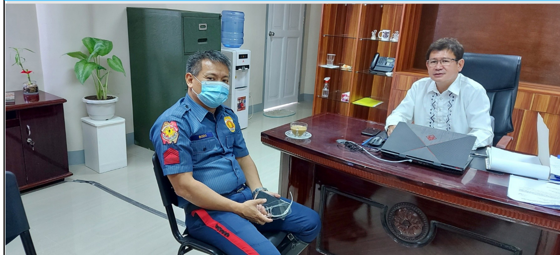
Meeting for the Info Drive Project on our National and Provincial Road Signages for safer travel