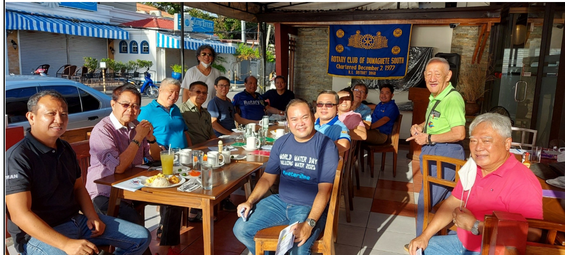
Early Start at the Sun room to catch vitamin D